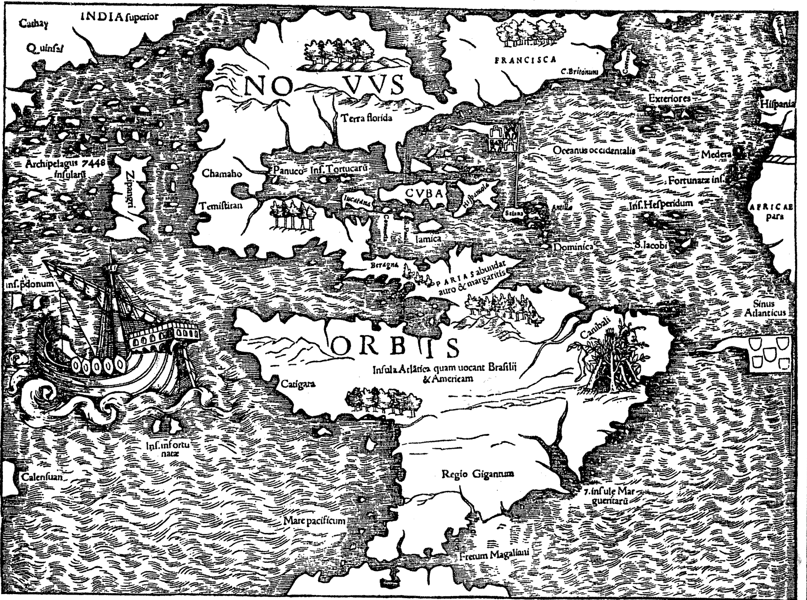
A MAP OF THE NEW WORLD, 1540 A.D.