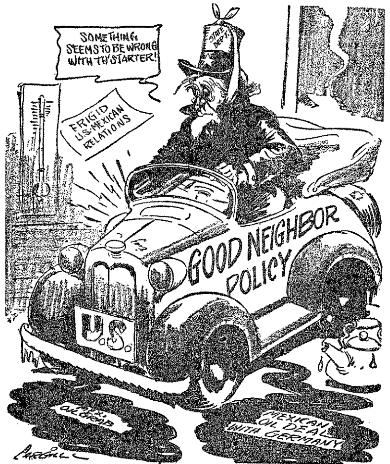
—Reprinted from the Plainfield, N. J., Courier-News.