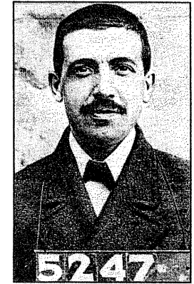
Charles Ponzi was already a convicted forger and larcenist when he began a new career selling swampland in Florida to unduly eager investors.

There were other compelling forces. Choice “beachfront” lots could, by a flexible approach to mensuration, be 10 or 15 miles from the water. The noted Charles Ponzi of Boston, whose name is durably associated with investment operations that paid handsome dividends to earlier investors from the money coming in from later ones, had turned now to the real estate business.