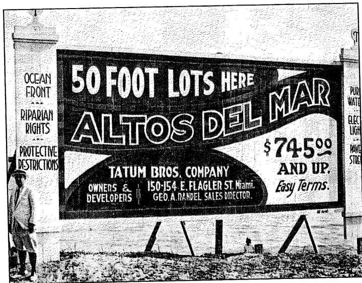
The 1920s Florida land boom came to an end when the supply of new and adequately gullible buyers dwindled and thousands were left homeless after a hurricane.

Caribbean in the autumn of 1926 were held to be at fault. Thousands were, indeed, left homeless. The responsibility for the debacle was thus shifted from man and his capacity for financial delusion to God and the weather. Also, if slightly, to misguided charitable enterprises in response to the wind. An official of the Seaboard Air Line was quoted in The Wall Street Journal as expressing the fear that the solicitation of Red Cross funds for hurricane relief would “do more damage perma-