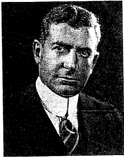
Charles Mitchell, head of the National City Bank in 1929, offered to lend the public enough money to offset any unwanted restraints by the Federal Reserve.

ward wave, stepped in to counter the threat. "We feel," he said of his bank in a statement of nearly unparalleled arrogance, "that we have an obligation which is paramount to any Federal Reserve warning, or anything else, to avert any dangerous crisis in the money market." The National City Bank would lend money as necessary to offset any restraint by the Federal Reserve.